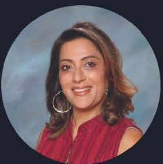
GAURI MEHTA VISUAL ARTS